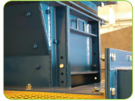
Top: Regulator Gate on Hopper Above: Optional Hydraulic Drive

We build bespoke Belt Feeders to suit virtually any industrial application. Our machines are always designed and manufactured to exceed the demands which will be put on them either by the nature of the feedstock, the operation, the environment in which the machine will operate, or any of these factors combined. We only build machines which last.