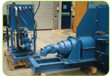
Top: Regulator Gate on hopper Above: Optional Hydraulic Drive